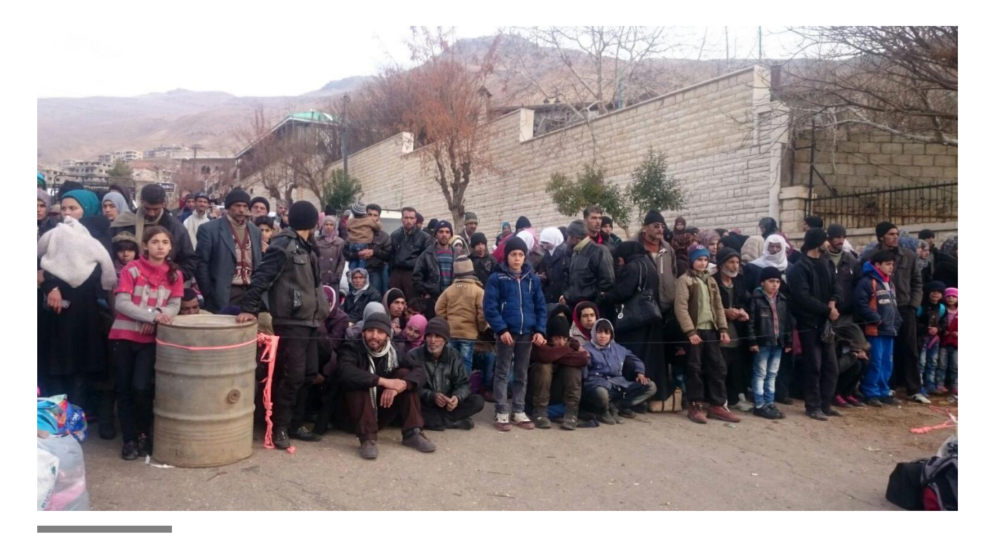
Residents wait for the arrival of an aid convoy in the besieged town of Madaya on January 11, 2016.

Ola died on May 26, 2016, joining 85 other people who had perished from siege-related causes since the siege on Madaya began – 65 from malnutrition and starvation, 14 from landmines, six from snipers, and one from a chronic health condition.<sup>2</sup> Almost all 86 could have been saved if they had had access to food, medication, medical equipment, and medical treatment by specialized health workers. But there is grossly insufficient food, medicine, and medical equipment in Madaya and two dentistry students and a veterinarian are left to care for the town's 40,000 residents. The lives of Madaya's remaining residents hang in the balance, with hundreds suffering the untreated effects of malnutrition, chronic health conditions, infectious diseases, and traumatic injuries.