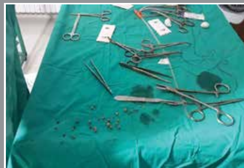
* Names have been changed for security