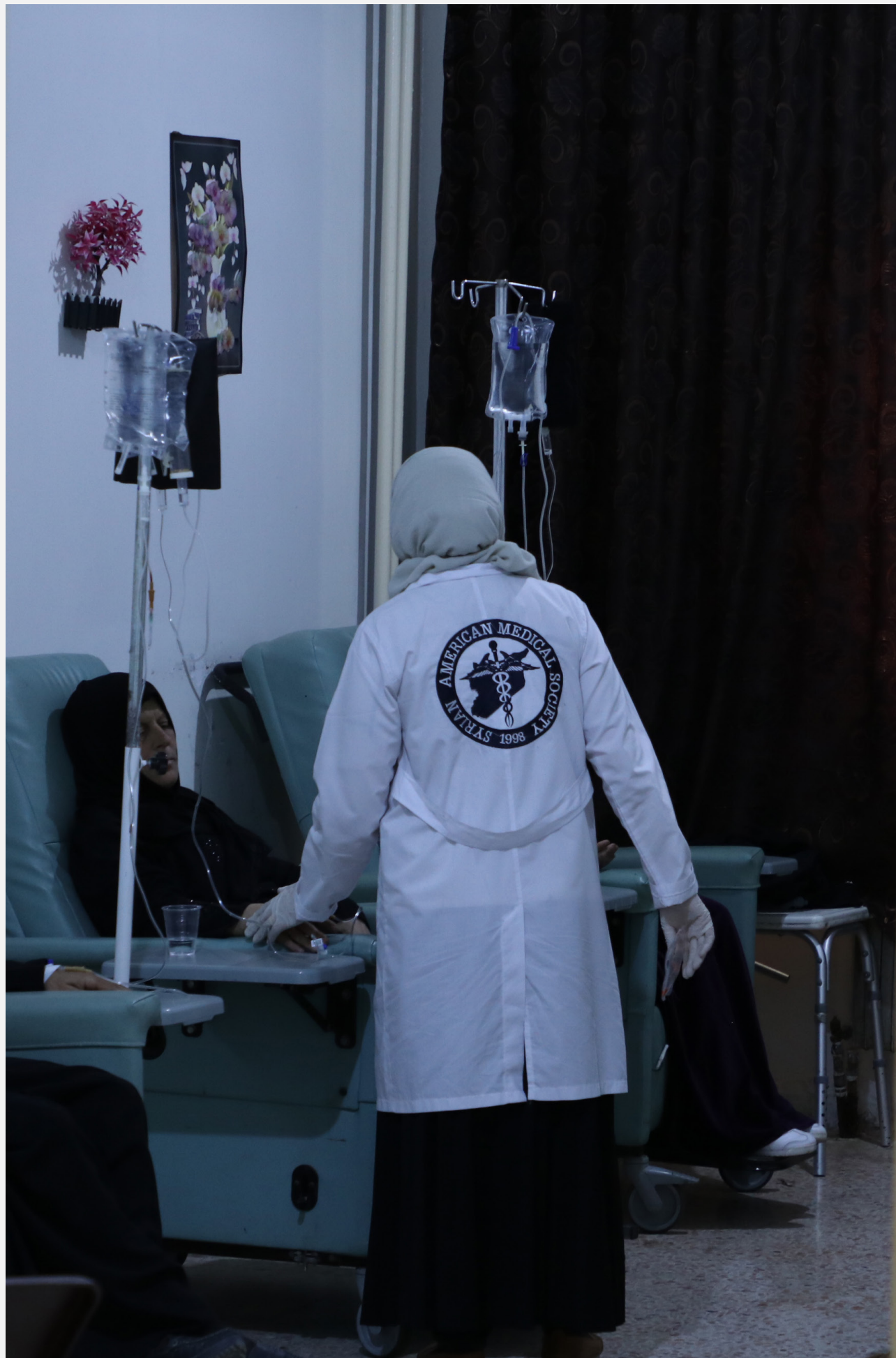
A nurse checking on a patient undergoing chemotherapy.