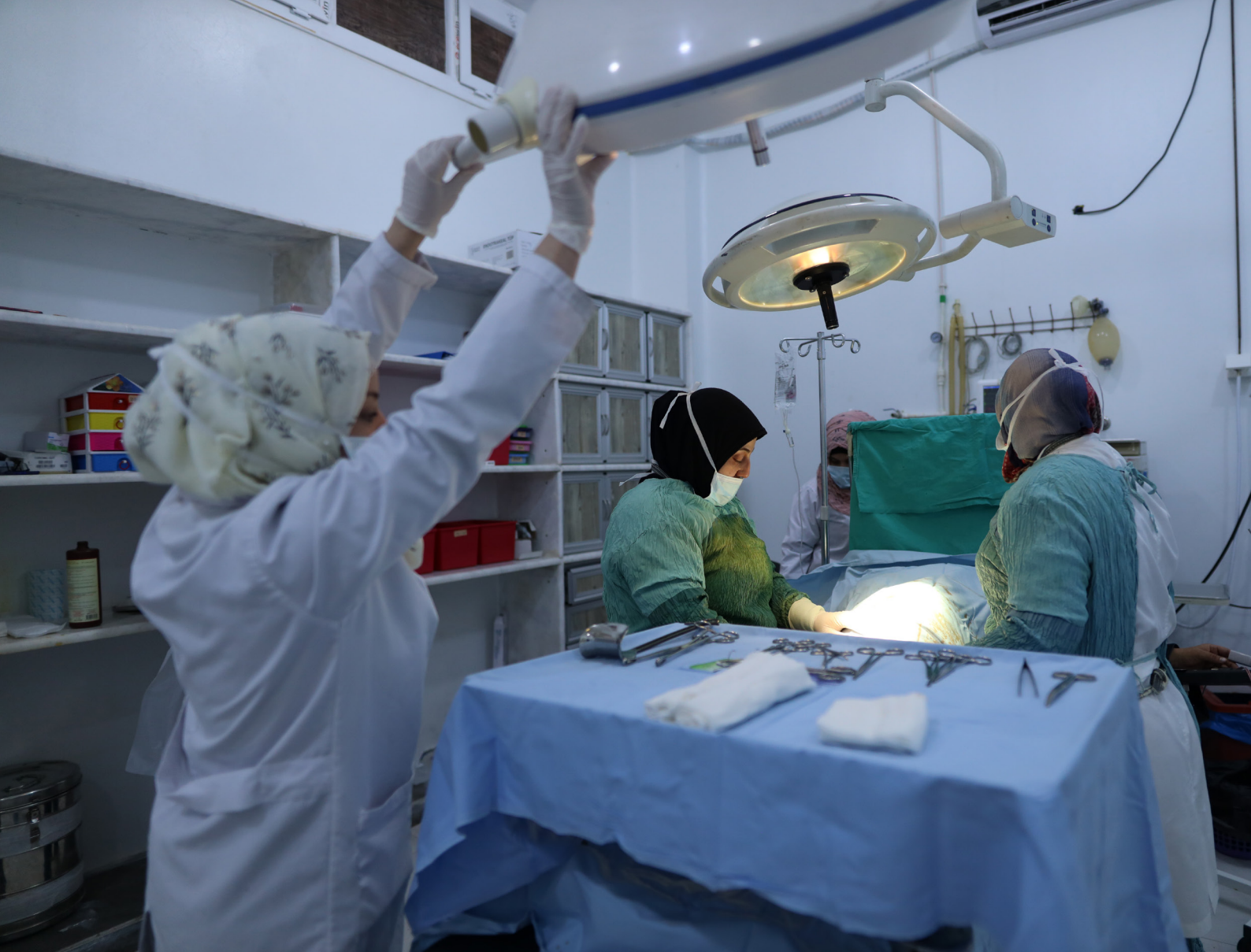
Doctors and nurses prepping for surgery at RI-run Nour hospital in Idlib.

Relief International (RI) is a non-profit organization working in 16 countries to relieve poverty, ensure well-being and advance dignity. We specialize in fragile settings, responding to natural disasters, humanitarian crises and chronic poverty.