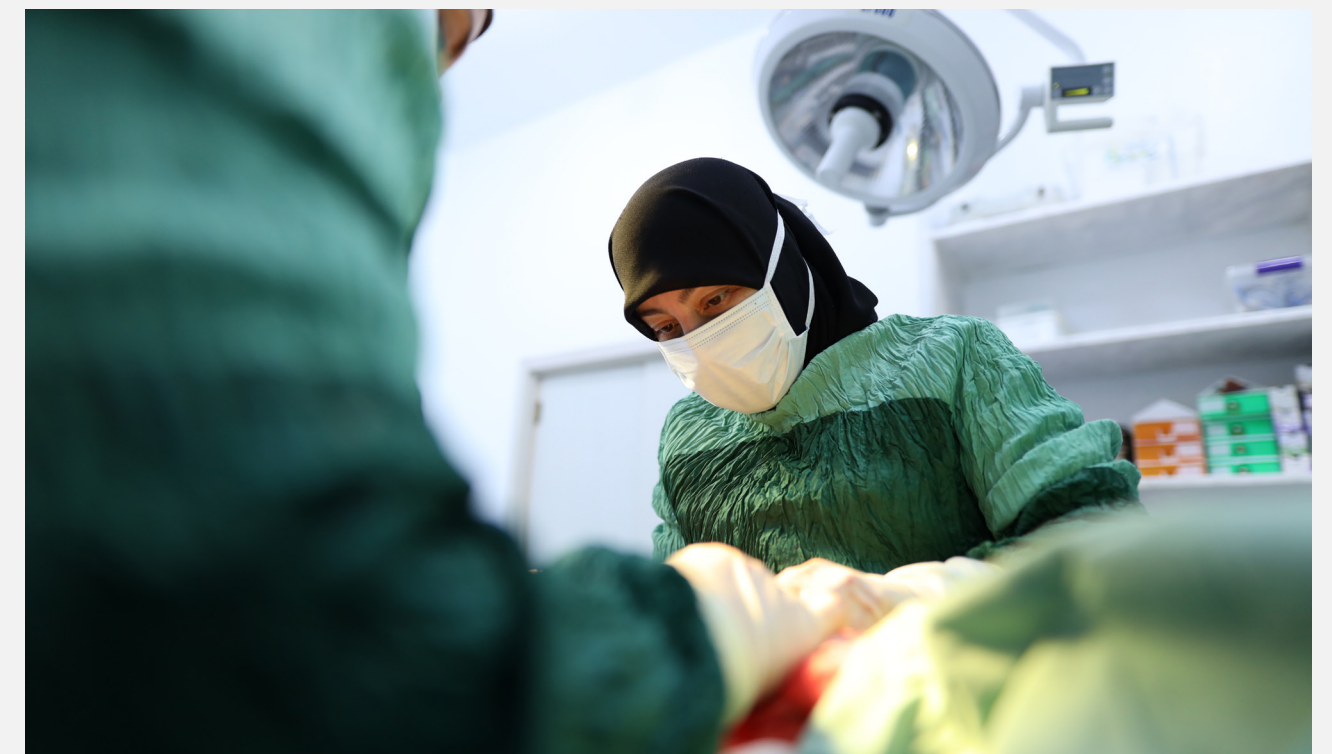
Doctors and nurses in surgery at surgery at RI-run maternity ward at Nour hospital in Idlib.

In an April 2022 survey conducted by Relief International in Idlib and Aleppo governorates, roughly half of interviewed women (49%) were not aware that they can do an initial self-examination of their breasts to check for nodes. Furthermore, among the surveyed women, 65% did not know where to go for a mammography screening should they need to. Less than half of women ( 40% ) said that they received awareness sessions on breast cancer or availability of specialised services , making an early detection of breast cancer less likely.