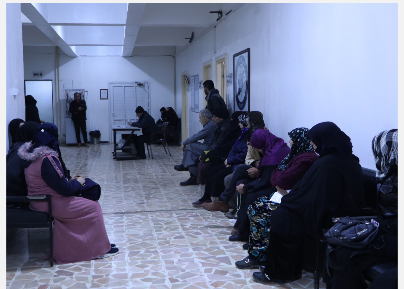
Waiting room at SAMS-run Idlib oncology center.

This further confirms that efforts and resources must be invested in establishing post-treatment care systems that would keep a record of a patient's health and treatment history, and have automated notifications in place when the time would come for a follow-up examination. This would give a possibility for medical staff to reach out to patients directly and offer options for further care .