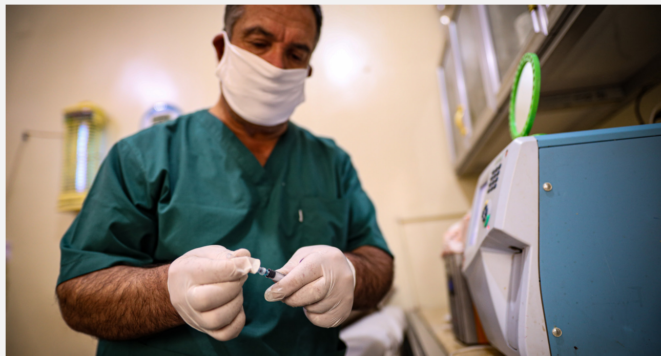
Medical professional performing a blood test at RI-run Nour hospital in Idlib.

The general laboratory testing during the treatment course (routine blood count and differential, blood chemistry, coagulation factors, etc.) is however not usually supported by NGOs , it would therefore require patients to go to private laboratories, with a fee that could vary from 20 to 100 USD per test, depending on whether the doctor has requested to perform also some additional tumour marker tests or not, making the testing unaffordable for many in an area where 97% of the population lives below the poverty line .