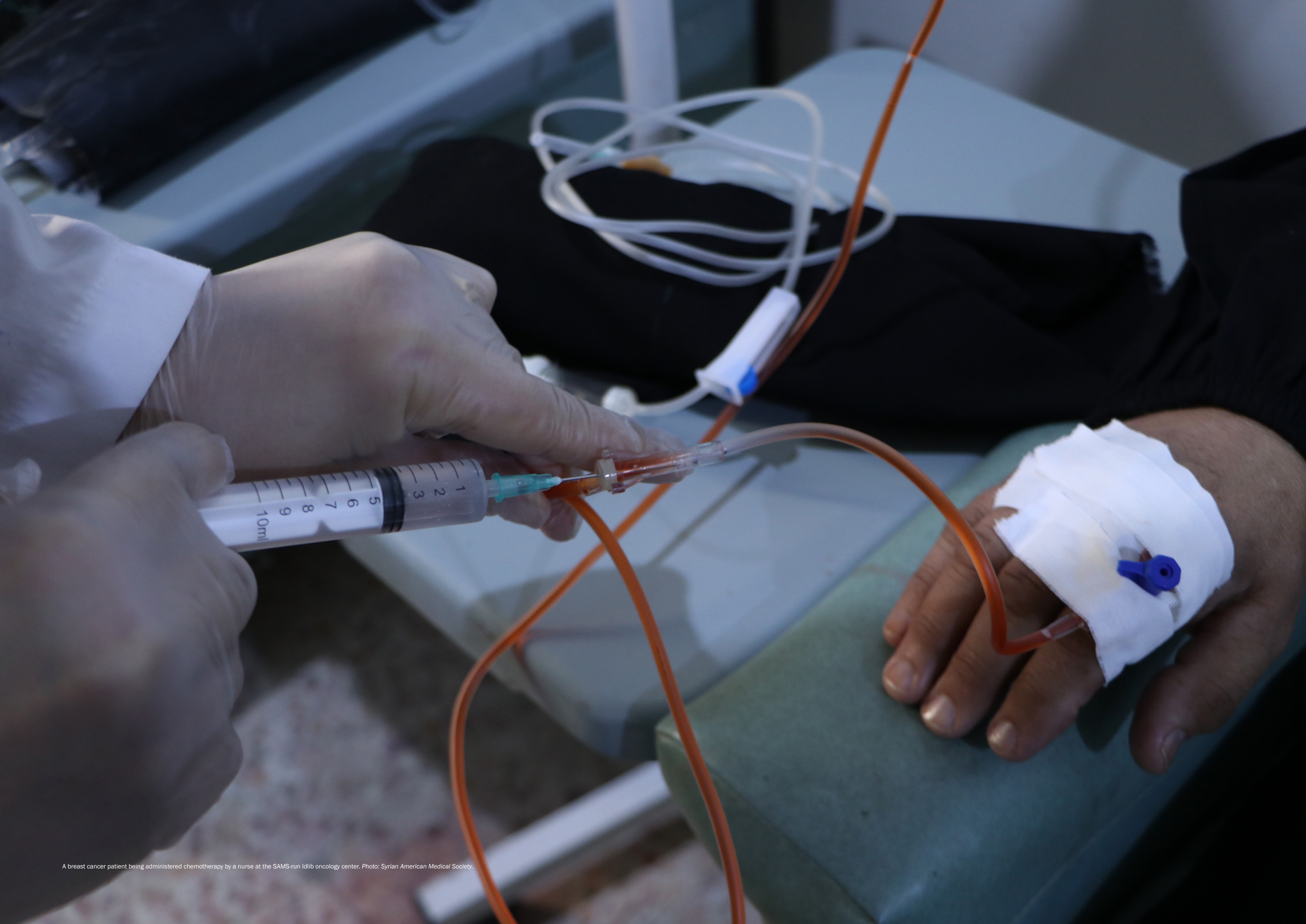
A breast cancer patient being administered chemotherapy by a nurse at the SAMS-run Idlib oncology center.