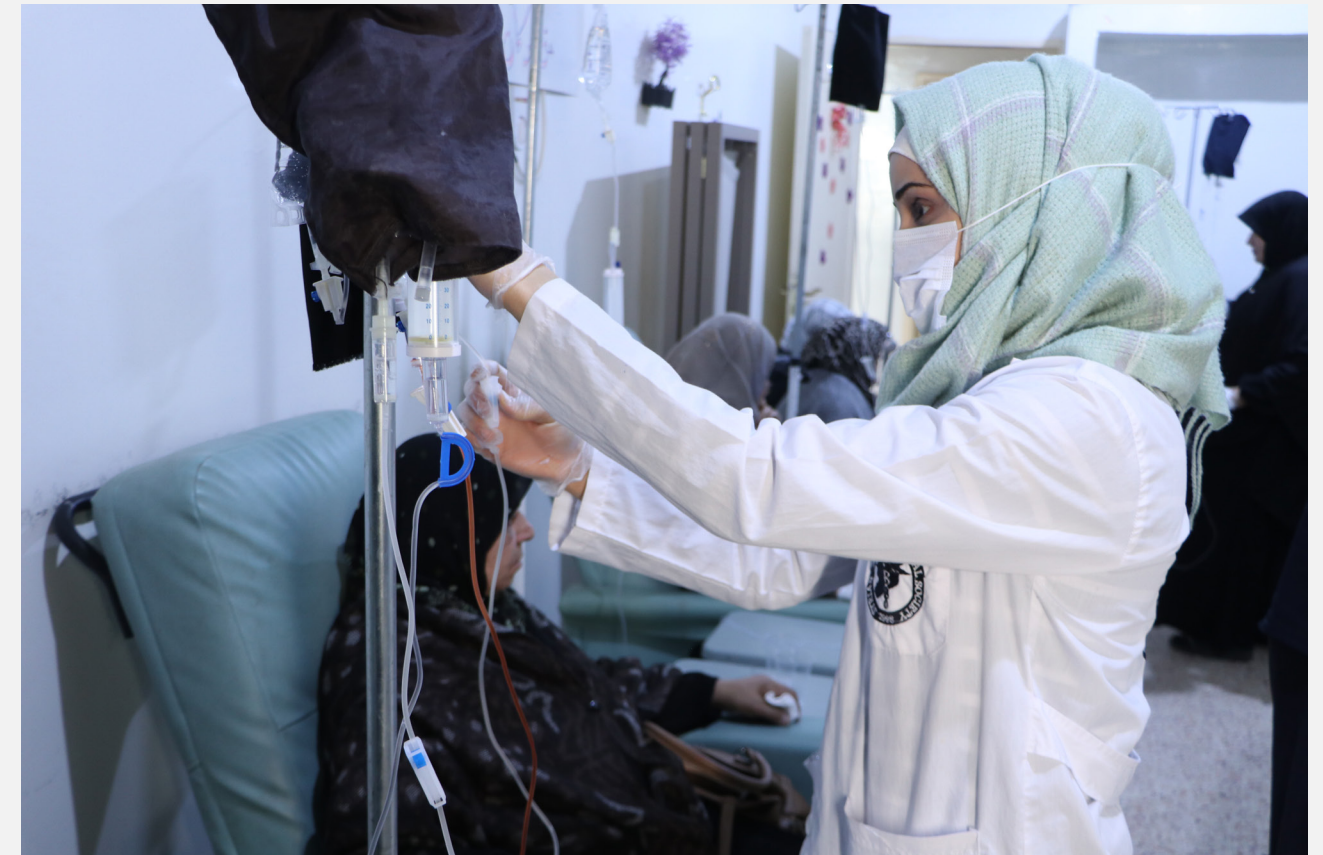
A nurse checking on the progress of chemotherapy at the SAMS-run Idlib oncology center.

Getting comprehensive information about available services for breast cancer is a cumbersome exercise. The NWS Health Cluster led by the World Health Organisation conducts service-mapping on a quarterly basis, however hospitals frequently declare that specific services are provided, while in reality they only partially exist . For example, some NGO-run hospitals declare availability of chemotherapy in their premises, however donor-funded projects do not include these medications in their standard kits for health. Instead, medical staff who can administer chemotherapy under the supervision of a doctor are available, but only if the patients themselves purchase the medications privately . Specific NGO-funded hospitals are mentioned as service providers in different stages of breast cancer screening and treatment cycle, while only one partner in NWS provides comprehensive services .